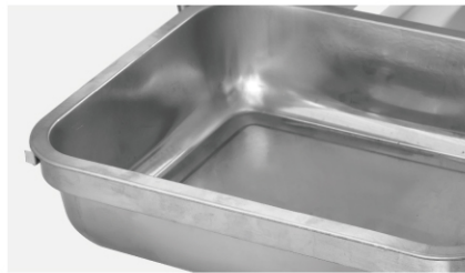
Stainless Steel Basin