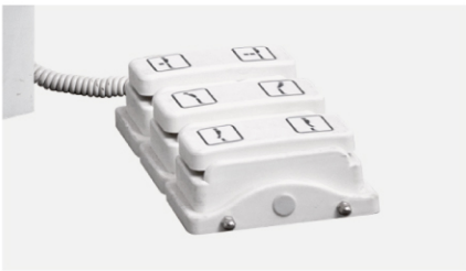
Pedal Remote Controller