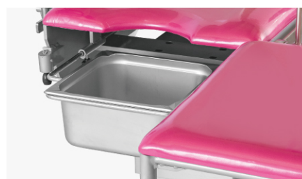
Stainless Steel Basin