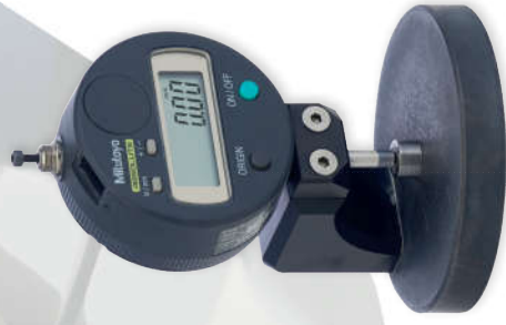
Mitutoyo Measuring Gauge

Alternatively, tablet weight and thickness can be entered into the TBF 100i system manually.