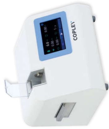
TBF 100i with open guard