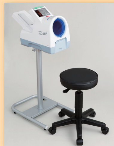
Optional stand & chair